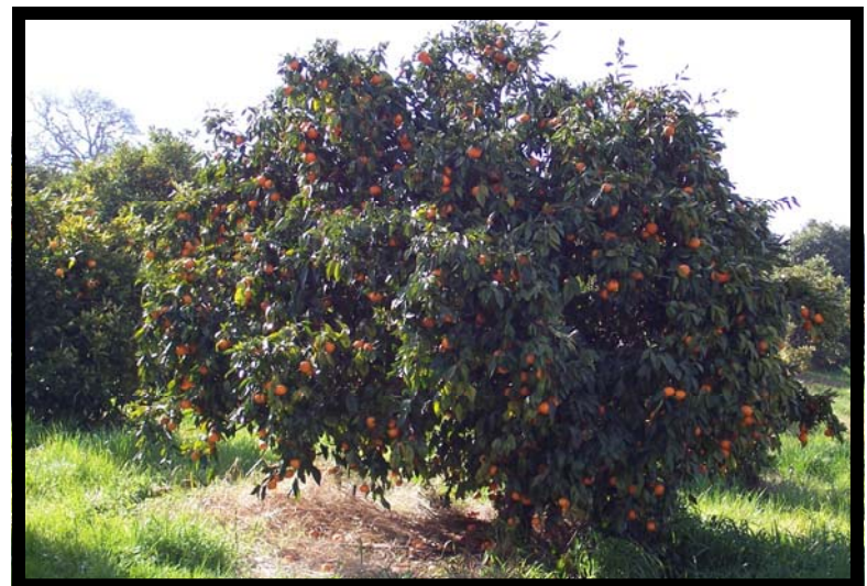
A tree from the 72 year old orange grove, ripe with fruit in February.